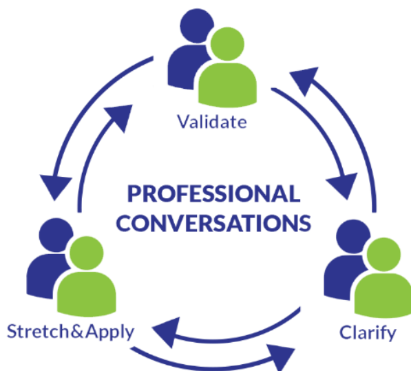
Appendix Figure 1: Coaching Protocol

Whenever possible, evaluators and peers should review data from classroom observations and goal information prior to meeting with an educator. Prior review of the data for the Planning, Mid-Year and End-of-Cycle Conferences allows the evaluator to 1) ensure effective use of meeting time, 2) plan for reflective questions, and 3) identify potential resources and determine next steps. Some find it helpful to use a coaching protocol to plan for and lead these conversations. Appendix Figure 1 below represents a protocol with components common to coaching models.